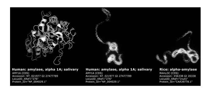
Fig. 2. Comparison of standard 3D ribbon diagram and calligraphic visualizations of human and rice amylase protein. (left) Human amylase, alpha 1A; salivary protein, standard 3D ribbon diagram structure. (middle) Human amylase, alpha 1A; salivary calligraphic protein stroke. (right) Rice alpha-amylase protein calligraphic stroke. Image orientation: The start (N-terminus) of each protein, including the standard 3D structure, is at the top-left of each image/stroke. 3D Representation: A standard representation of the 3D structure of amylase based on the atomic coordinates deposited in the protein data bank. Image rendered with Pymol [44].

We define aesthetically-impelled approaches as data-driven, yet neither hypothesis nor problem driven mappings between data and formal elements of its representation, such as shape, color, texture or line quality. Formal elements convey content that relates to or comments upon some aspect of the data or its context. The prior work of one of the authors (RW) in aesthetically-impelled approaches to working with vast and abstract data sets includes two ArtScience collaborations focused on hybrid processes and outcomes. Our conceptualization of DataRemix is informed by lessons learned in their development.