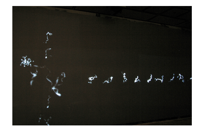
Fig. 4. Human gene character undergoing BLAST. The human gene (translated into protein) selected from the characters on the vertical axis is enlarged in the central area where the viewer's gesture traces had been. The collection of points at the upper left represents the query sequence being segmented into "words" that are compared to the target database sequences depicted on the horizontal axis.

We visualized the BLAST algorithm as it operates on DNA and amino acid sequences. This required implementing our own BLAST code based on the NCBI distribution[16] and developing methods to visualize intermediary products of the algorithm as it was running and acting upon the calligraphic sequence visualizations. The selforganizing eight-member collaboration that produced Ecce Homology